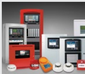
Fire Detection and Alarm System

MACKINS Fire Protection System Division is specialized in Design, Engineering, Integration, Testing, Commissioning and Maintenance of the following Fire Protection Systems.