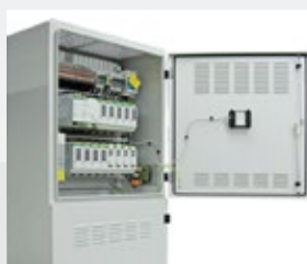
Central Battery system