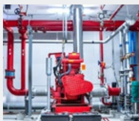
Fire Suppression and Fighting System