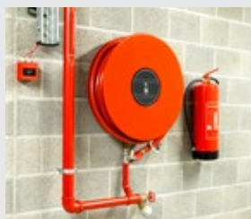
Fire Hose Reel and Hydrant System