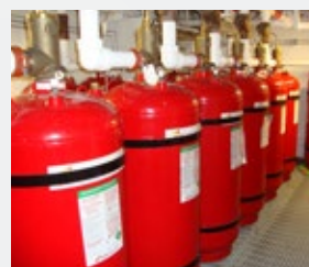
FM200-Clean Agent System