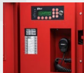
Emergency Evacuation System